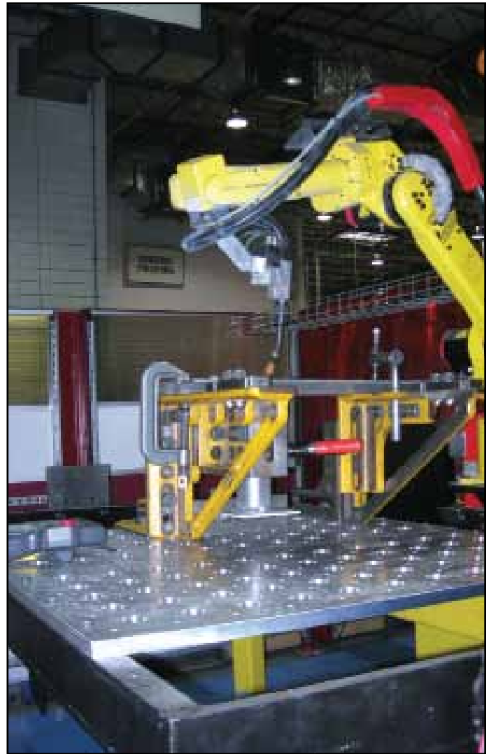
Robotic Welding Center

We do not rest until our customers' products are delivered where and when they are needed. EMT owns and operates a private fleet of trucks which can be dispatched quickly for local customer deliveries. For non-local deliveries, we can coordinate logistics for clients' shipments through our national carrier relationships or work with customer-designated carriers.